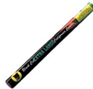
Handheld Fountain (does not shoot flaming balls)