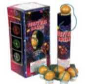
Aerial Shell with Mortars