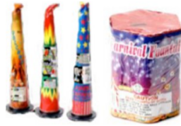
Base Fountain Sparkler Cone Fountain