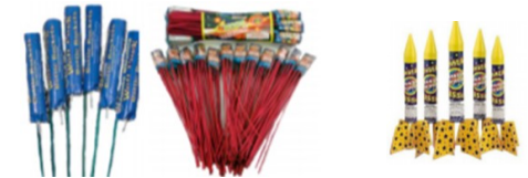
Bottle Rockets, Sky Rockets, Missile Rockets