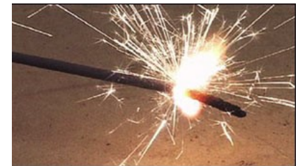
Sparkler 1800-3000° F