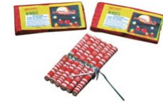
Crazy Jack, Jumping Jack, Bees, Helicopters