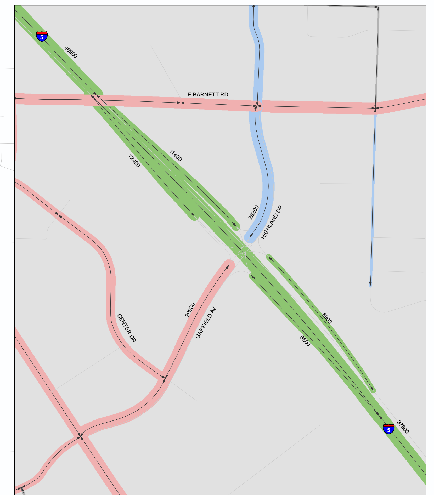
SOUTH MEDFORD INTERCHANGE (EXIT 27)