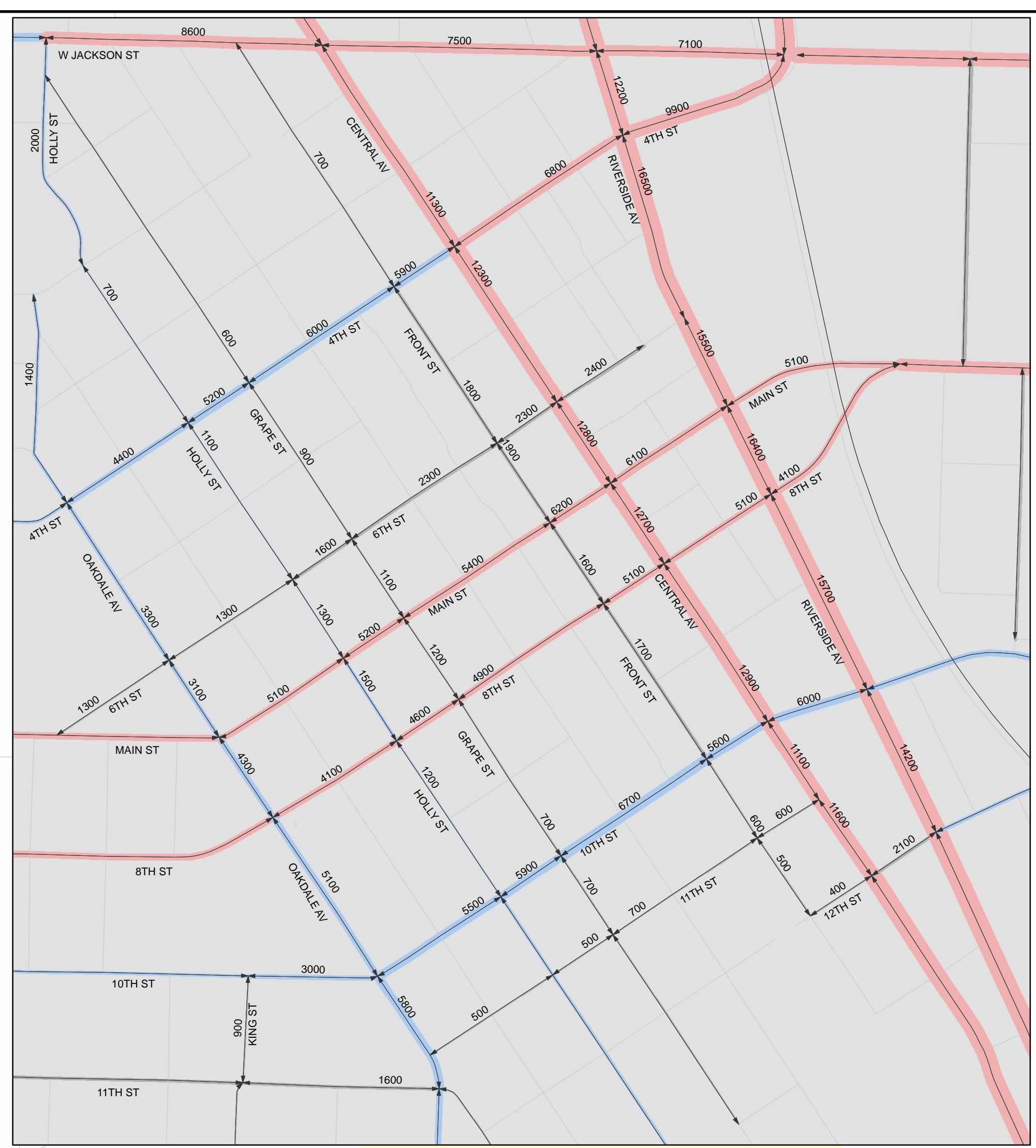
DOWNTOWN DETAIL MAP